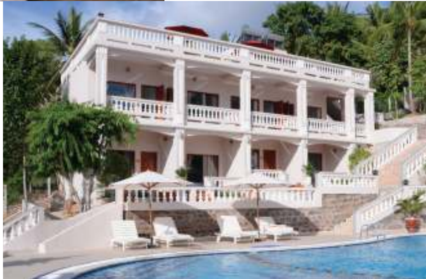
» Right: Executive Poolside