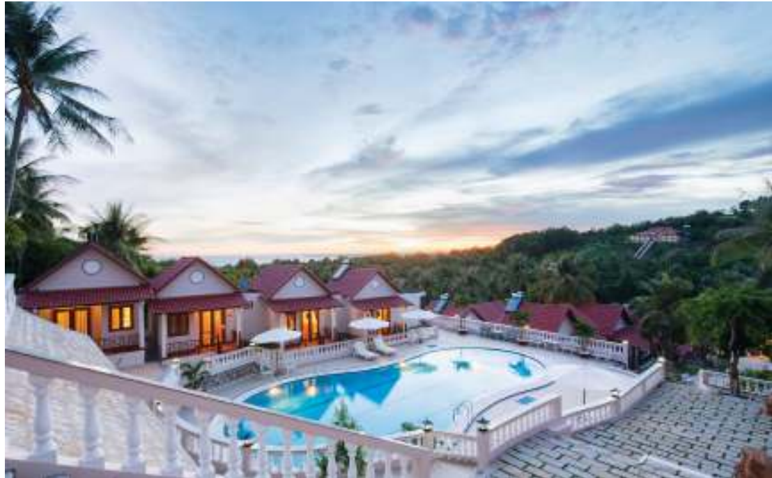
» Right: Premier Pool Side